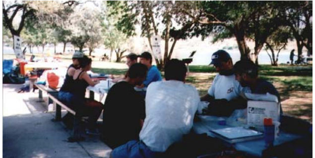
The Think Tank competition.