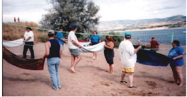
Seventh Fleet members participate in Bladderball.