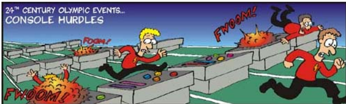
All Sev Trek cartoons found at www.sev.com.au