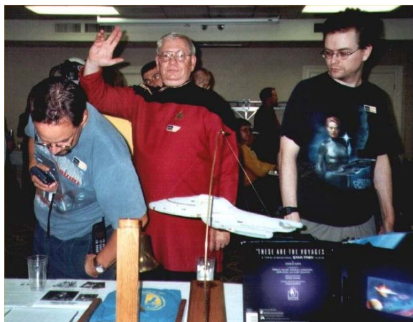
Ticonderoga crewmembers check out the display.