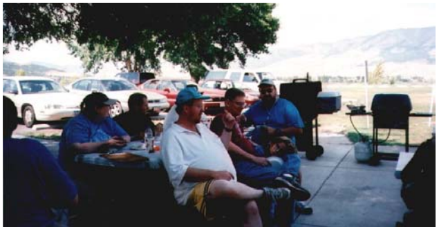
Enjoying the BBQ at the Olympics.