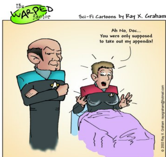
After enduring years of Tom Paris' jokes and jibes, The Doctor finally seizes the opportunity for retribution.

M'Vok: Thank you. And that is all the time we have for this session of the Star Trek Advice Review. Please join us next time, and don't forget – "If you have a problem that you just can't solve, let S.T.A.R. help!"