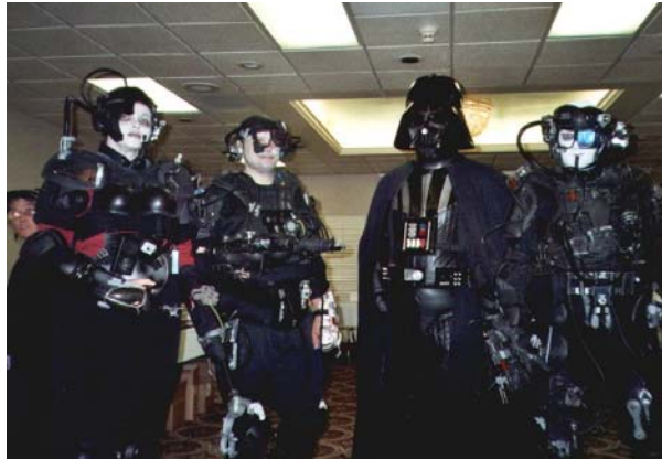
Distant Cousins? Vader and the Borgs