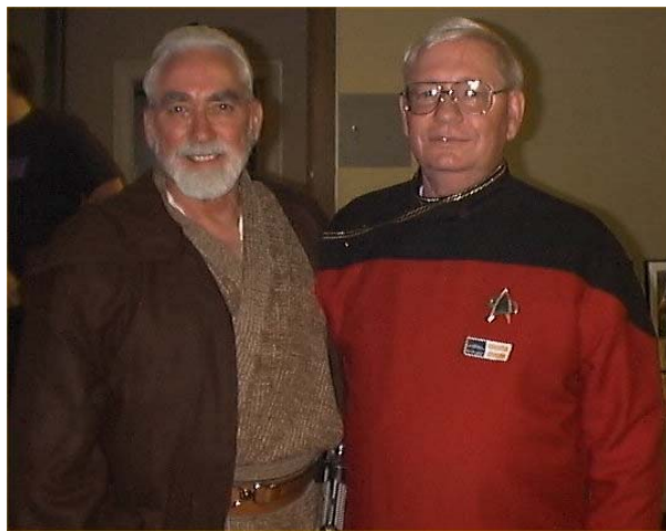
Yes Star Wars & Star Trek fans do get along.