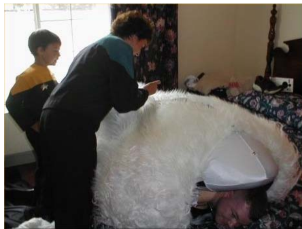
CMO Buck performs Xenosurgery at the con.