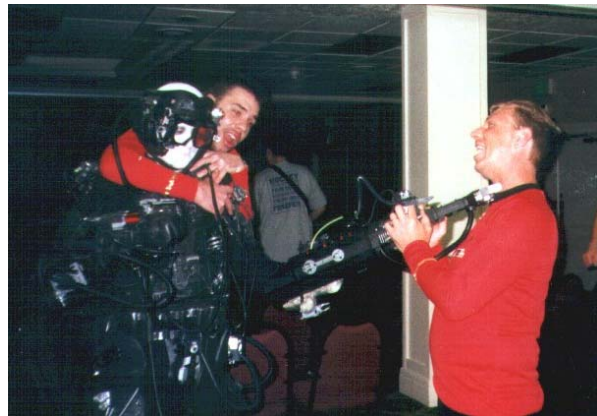
I think the Redshirts have everything in hand.