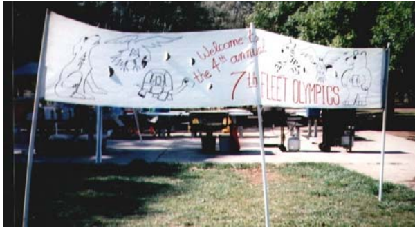
The Olympic Banner with all Fleet mascots represented.