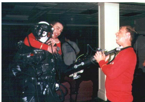
I think the Redshirts have everything in hand.