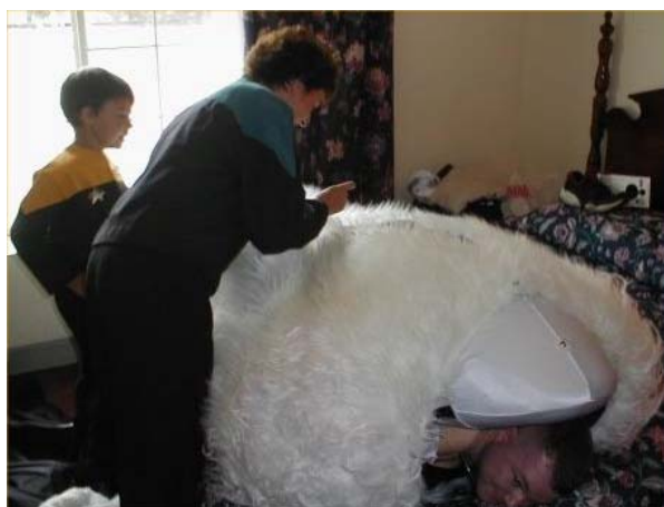
CMO Buck performs Xenosurgery at the con.