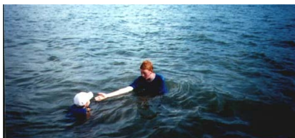
Younger members enjoy a swim.