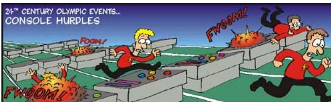
All Sev Trek cartoons found at www.sev.com.au