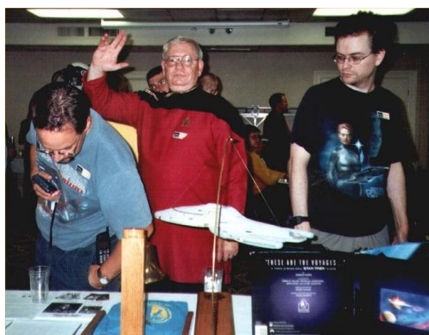
Ticonderoga crewmembers check out the display.