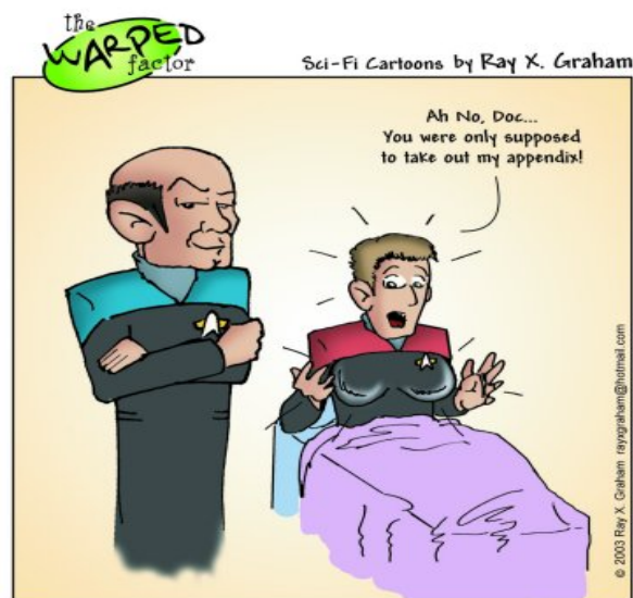
After enduring years of Tom Paris' jokes and jibes, The Doctor finally seizes the opportunity for retribution.

M'Vok: Thank you. And that is all the time we have for this session of the Star Trek Advice Review. Please join us next time, and don't forget – "If you have a problem that you just can't solve, let S.T.A.R. help!"