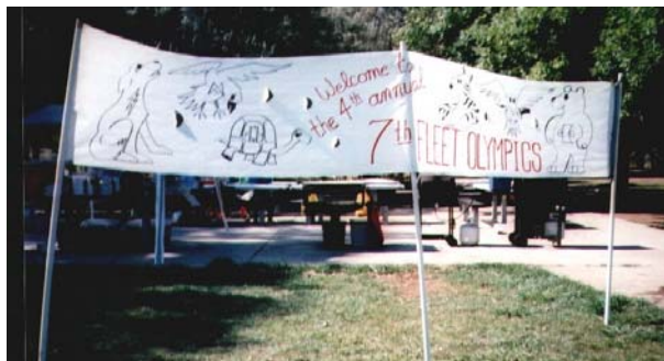
The Olympic Banner with all Fleet mascots represented.