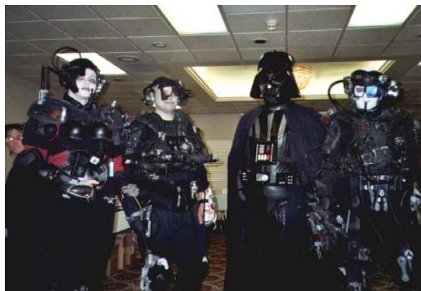
Distant Cousins? Vader and the Borgs