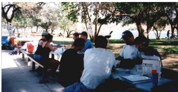
The Think Tank competition.