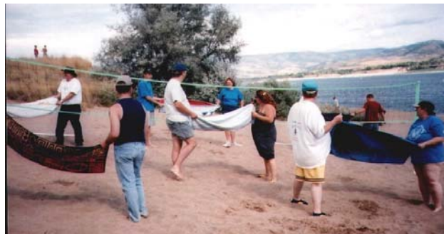
Seventh Fleet members participate in Bladderball.