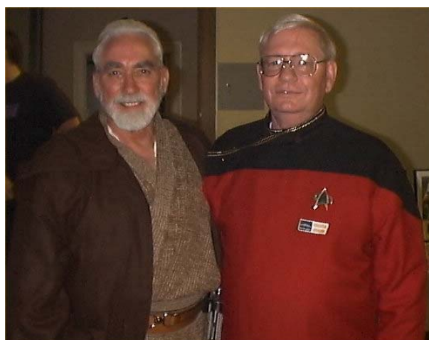
Yes Star Wars & Star Trek fans do get along.