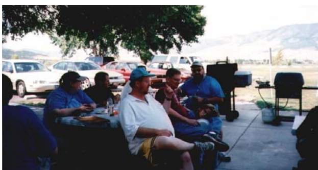
Enjoying the BBQ at the Olympics.